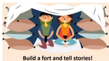
Build a fort and tell stories!