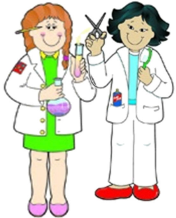
Where might we see them?

For the weekly £1 contribution which goes to wards extra for the children.