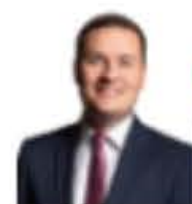
Wes Streeting MP for Ilford North